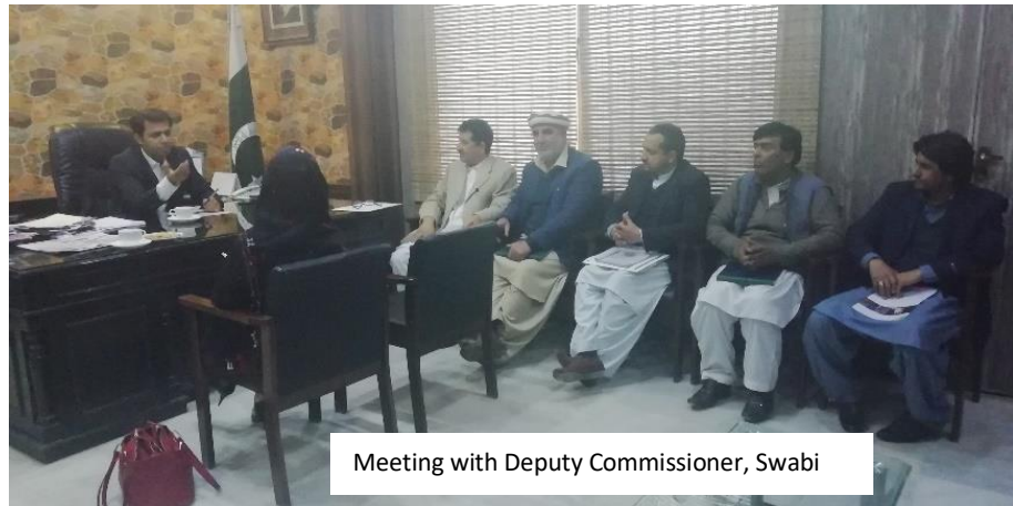
Meeting with Deputy Commissioner, Swabi

Another meeting was held with the Deputy Commissioner Swabi, which was also attended by all the stakeholder departments such as; District Education officers (male & female), AD-Local Government and Child Officer of the District Child Protection Units of Social Welfare Department. Similar meetings were held with the district stakeholder departments in Tribal District Khyber and Muhmand, where Focal Persons were appointed for coordination of the Project's activities.