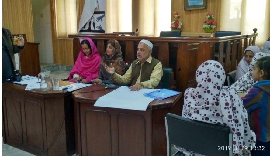
District Nazim Swabi

The Local Government system is in place in KP but not yet in the ex-tribal areas. The WVCs in District Swabi and Kohat were invited through the office of Assistant Director Local Government (Coordinator) as well as DAC Office.